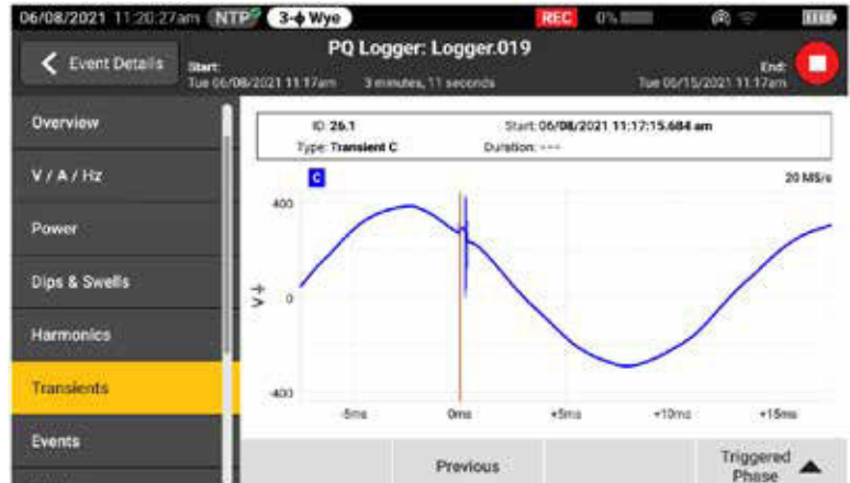
View real-time voltage transitory events while logging for faster troubleshooting

Transients negatively impact otherwise healthy systems every day and their potential to damage your equipment can't be underestimated. Whether your system is experiencing impulsive or oscillatory transients, the results can be devastating and cause problems ranging from insulation failures to total equipment failures. The Fluke 1775 and Fluke 1777 incorporate advanced transient capture technology to help you clearly identify high-speed voltage transients, so you have the data you need to stop them in their tracks. The Fluke 1775 Power Quality Analyzer has 1MHz sampling capability to capture fast transients, while the Fluke 1777 Power Quality Analyzer has 20MHz sampling capability to capture the fastest transients in high detail.