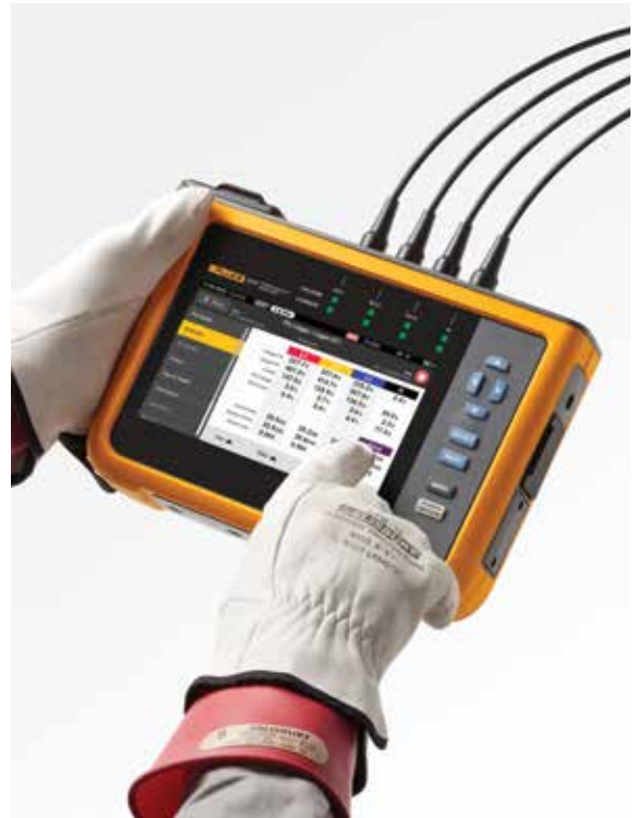
Easily navigate using the large color touchscreen

When downloading data from the Fluke 1770 Series Power Quality Analyzers the included Energy Analyze Plus software package can compare measured voltage and current harmonic statistical data to different standards, like EN 50160 or IEEE 519, to determine if they exceed compliance limits. This powerful predictive maintenance feature enables current harmonics to be observed before distortion appears in the voltage allowing you to prevent unexpected failures or non-compliance situations and increase system uptime. With the proliferation of inverter-based loads and power generation, keeping current harmonics in check is becoming increasingly critical to ensure reliable power quality and avoid system downtime.