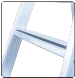
Wide slip resistant steps for increased stability