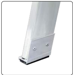
Slip-resistant foot pad for maximum grip on any surface