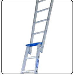
Dual purpose function