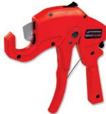
No. 55005 / No. 55015