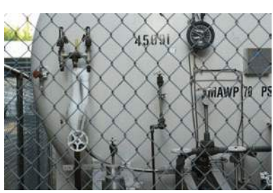
Difficult inspection sites