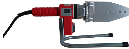
SHS 63 (230V)

With suitable welding sockets for pipes and fittings made of PE or PP in accordance to DVS guidelines. With anti-stick coating having a long service life.