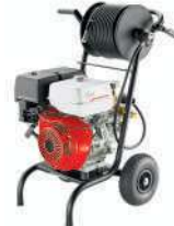
HD 13/150 B